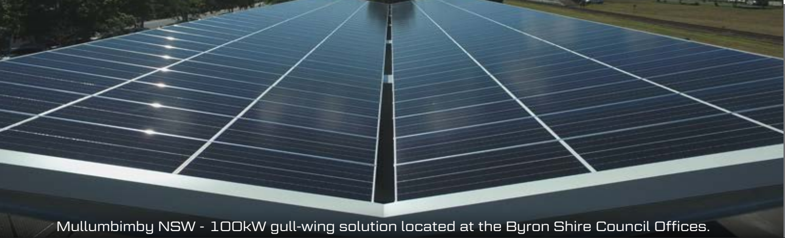
Mullumbimby NSW - 100kW gull-wing solution located at the Byron Shire Council Offices.